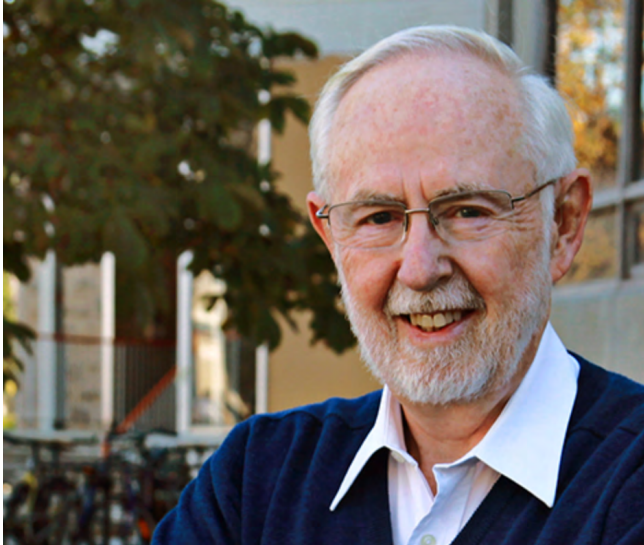
Queen's University Nobel Laureate Art McDonald was part of a team of Queen's researchers that collaborated on a simple, quick-execution ventilator design.